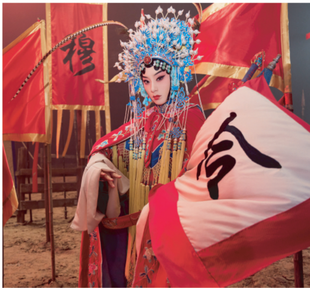
Yu Opera 豫剧