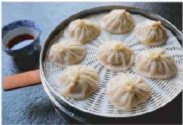
灌汤包 Steamed Soup Bun