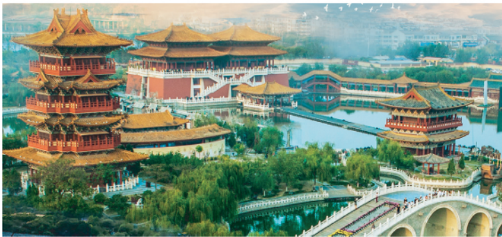
清明上河园 Millennium City Park