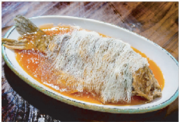
鲤鱼焙面 Fish With Fried Noodles