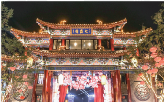
七盛角 Qisheng Jiao