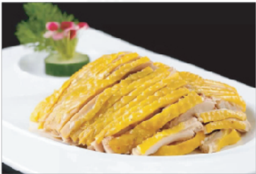
桶子鸡 Kaifeng Salted Chicken