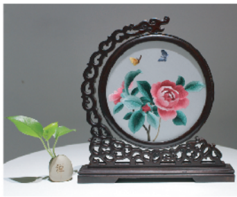
Bian Embroidery 汴绣