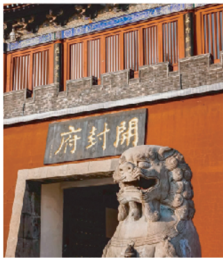
Kaifeng Prefecture 开封府