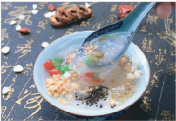
杏仁茶 Almond Tea