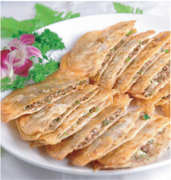
羊肉炕馍 Mutton Pancake