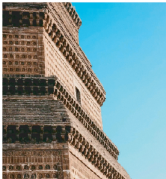
Po Pagoda 繁塔